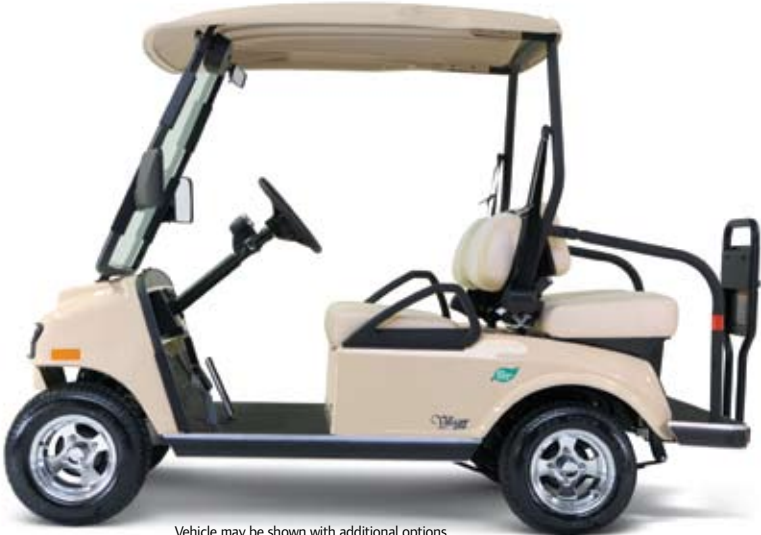
Vehicle may be shown with additional options

The electric Villager LSV is legal to drive on many city streets with speed limits of 35 mph or less, carries up to four adults and never has to stop for gas. Villager fits your mobile lifestyle and is the financially and environmentally smart way to make those short trips. Villager LSV — for people who Think & Drive.